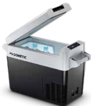
Portable fridge or freezer, 21 l

Dometic's versatile addition to the portable fridge/freezer range features a lightweight and extremely compact design that can be taken on any outdoor adventure. Fitted with strong handles, a removable lid and an efficient interior storage layout, the CFF 20 combines convenience with excellent cooling performance. Dimensions depth, 660mm Dimensions height, 430mm Dimensions width 283mm