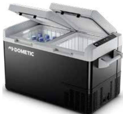
Portable fridge and freezer, 70 l, insulated cover included

Dometic's versatile addition to the portable fridge and freezer range comes with a stylish design, dual zone compartments and is complemented by an efficient interior storage layout that will suit all types of outdoor enthusiasts. The full wrap evaporators built into the CFF 70DZ Pack ensures excellent cooling performance and it comes with an insulated cover that provides maximum protection 70 (40/30) l of storage for convenient cooling and/or freezing. Dimensions depth, 443mm Dimensions height, 500mm Dimensions width, 914mm