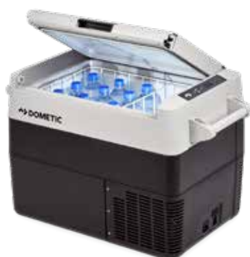
Portable fridge/freezer, 44 l

Dometic's versatile addition to the portable fridge/freezer range comes with a stylish design, double-sided opening lid and is complemented by an efficient interior storage layout that will suit all types of outdoor enthusiasts. The full wrap evaporator built in to the CFF 45 Pack ensures excellent cooling performance and it comes with a cover that provides maximum protection.