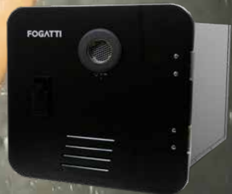
Fogatti Hot Water Black - 5517 Fogatti Hot Water White - 5518