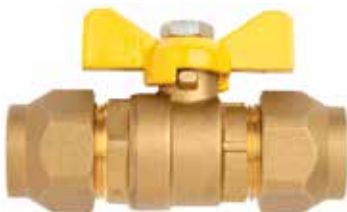
Inlet Connection 1/2" SAE Outlet Connection 1/2" SAE