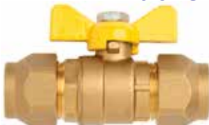
Inlet Connection 3/8" SAE Outlet Connection 3/8" SAE