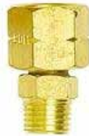
Brass 3/8" BSPFLHX x 1/4" BSPM