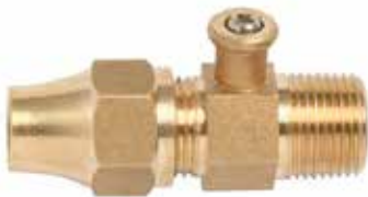
R-3/8" Male x 5/16" SAE Flare including nut