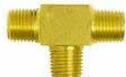
Brass Tee 1/4" BPM x 1/4" BSPM x 1/4" BSPM