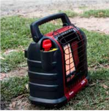
9kg Gas Bottle Cover