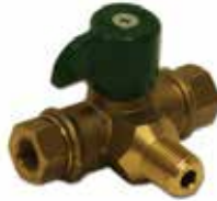
Inlet Connection 2 x 7/16" inverted flare Outlet Connection 1/4" NPT