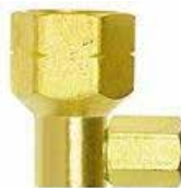
Brass, 3/8" BSPF LH x POL Female 90 degrees