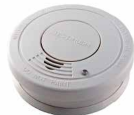
Stand Alone RV Smoke Alarm - 0729

Advanced 9V battery-operated smoke alarm designed specifically for use in caravans and RVs, ensuring safety on the go.