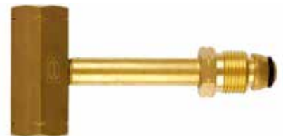
Primus POL26 - 5657