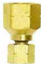
Brass, 3/8" BSPF LH x POL Female