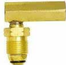
Adaptor brass 90 degree POL Male x 3/8" LH Outlet.