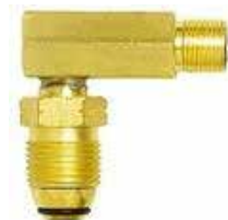
POL cylinder to Primus fitting with 90 degree elbow.