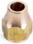
1/4" MALE SAE - 5602 5/16" MALE SAE - 5603 3/8" MALE SAE - 5604