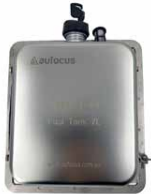
7L Stainless Steel Diesel Fuel Tank

364mm W X 395mm H X 100mm D Includes Lockable cap and side tank viewing.