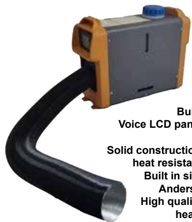
12V 2KW Portable Diesel Heater

Built in 3.5L tank. Voice LCD panel with remote control Solid construction - high grade heat resistant hard casing Built in silent fuel pump Anderson Connector High quality muffler with heavy duty clamp