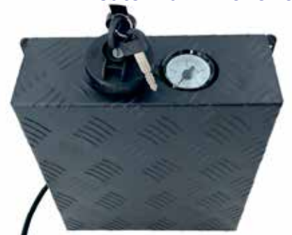
Aluminum Black Checker Plate Diesel Heater Tank Cover 5L

Black checker plate fuel tank cover Black checker plate mounting plate Increases mounting options and provides additional protection to the 5L stainless steel fuel tank.