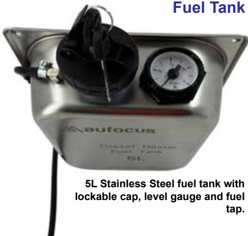
5L Stainless Steel Diesel Fuel Tank

5L Stainless Steel fuel tank with lockable cap, level gauge and fuel tap.