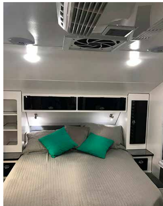
Sahara CP700 - 8819

Keep dust out without blocking ventilation points Enjoy less maintenance and cleaning Reduce allergies brought on by dust Safeguard your electronics by keeping dust out Protect your equipment and caravan Peace of mind that your protected from dust