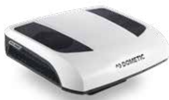
Coolair RTX 2000 - 8806

UP TO 6 H MAXIMUM COOLING BOOST MODE QUIET