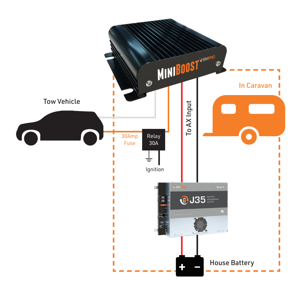
Figure 3: Wired to J35