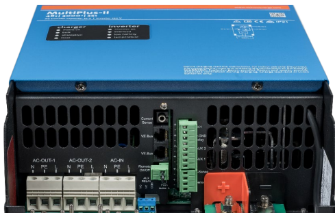
Connection Area MultiPlus-II 3k

Measures battery voltage and temperature and allows monitoring and control with a smart phone or other Bluetooth enabled device.